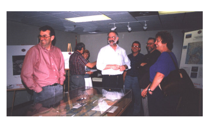
Client: Government of Yukon

Inukshuk developed a public consultation program and organized an Open House to explain the expansion plans. Displays, brochures and comment sheets were prepared and concerns researched to ensure public support.